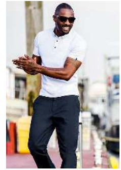
Keep it simple... Dress like Idris Alba ;-)

Unlike other Catholic schools that may utilize a strict dress code as a way of enforcing firm discipline (perhaps in absence of other authentic ways of forming students in the ways of self-discipline and self-respect), our policy aims to create a uniform that keeps things simple and attractive, while uniting our student body "as one" (as the word "uni-form" means). Through our uniform, we believe in a unity through diversity. Our uniform policy allows students to be comfortable and appropriately self-expressive, within the bounds of a dress code that ensures all students present themselves with pride and age-appropriate professionalism. Above all, we hope to keep it relaxed, simple, natural, affordable, flattering, & chic.